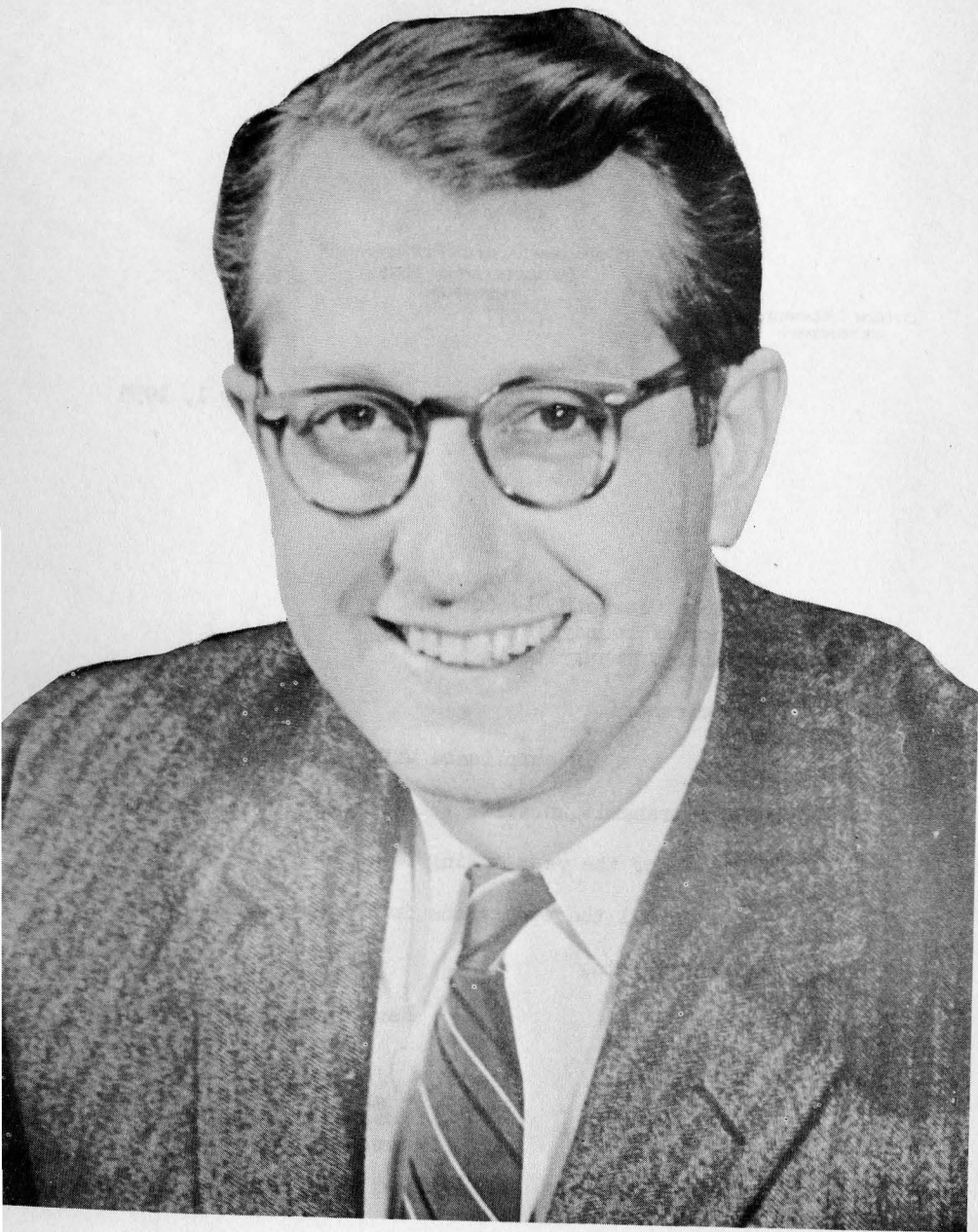
GEORGE M. LEADER Governor of Pennsylvania