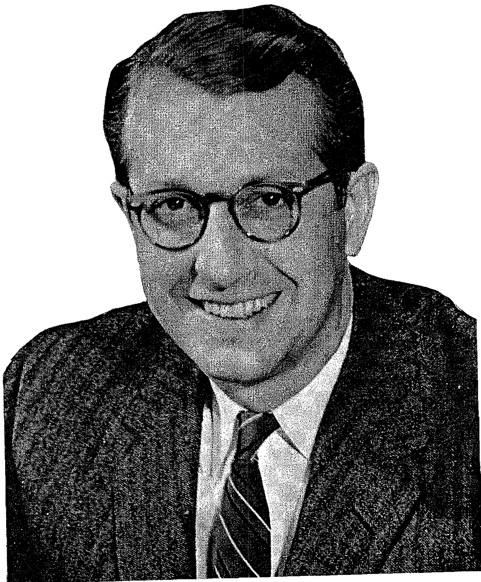
GEORGE M. LEADER Governor of Pennsylvania

Governor George Michael Leader was born in York County three miles south of York on January 17, 1918, third of seven children born to Guy A. and Beulah Boyer Leader. He is the second youngest Governor ever elected to the Chief Magistrate's office of the Commonwealth of Pennsylvania and the third member of his political party to occupy that post since the Civil War.