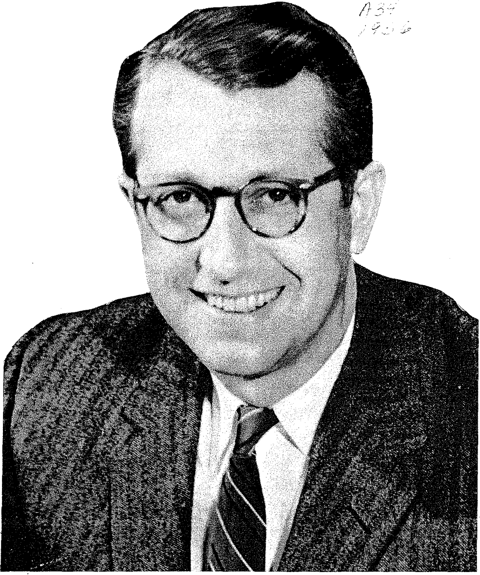
GEORGE M. LEADER Governor of Pennsylvania