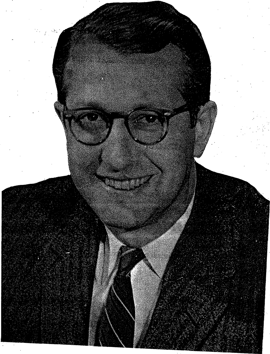
GEORGE M. LEADER Governor of Pennsylvania